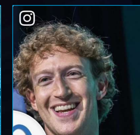
Evolving AI on Instagram: " 🚨 Meta just dropped massive AI ann... instagram.com