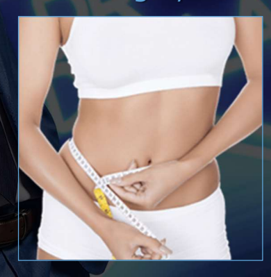
After Weight Loss Surgery